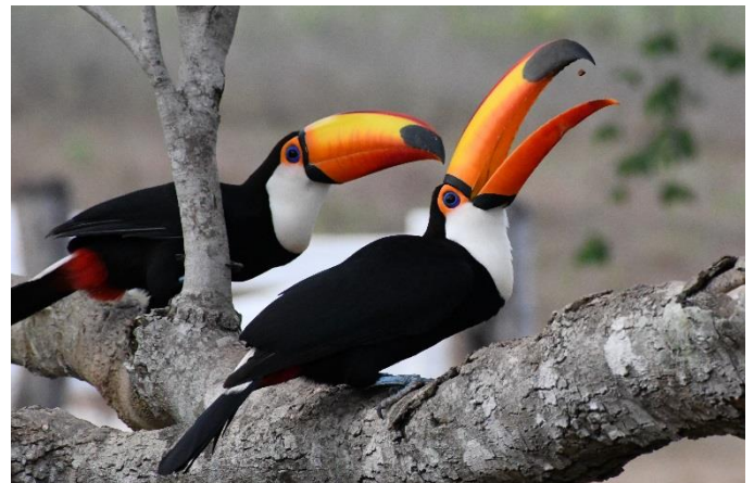
Jaguar, Giant River Otter, Toco Toucan